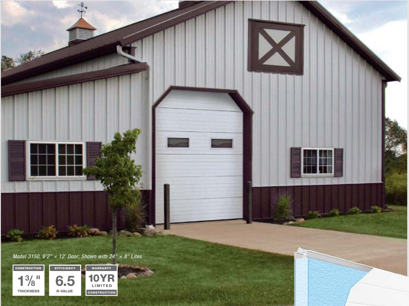
Model 3150, 9'2" x 12' Door; Shown with 24" x 8" Lites