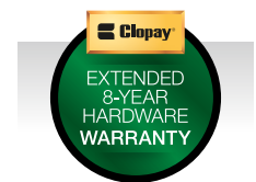
Upgrade your standard door with industrial-grade components.