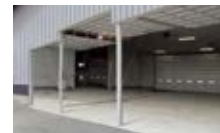
Carry-away, roll-away or swing-up mullions are available on select sizes.