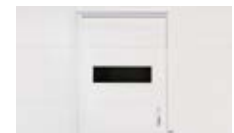
32" wide x 80" high (.81 m x 2.3 m), max 16'2" (4.9 m) wide section.