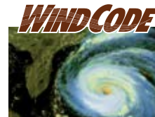
WindCODE® reinforcement available up to W1 design pressure (DP) 14 PSF, depending on size. Doors tested 50% greater than DP.