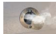
Can be cut into any type of sectional door. Available in select sizes.