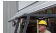
Single section and double sections available on select sizes.