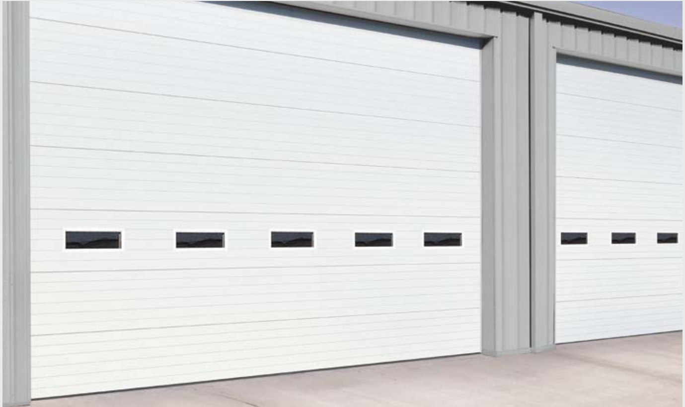
Model 3717, 16'2" x 14' Doors; Shown with 24" x 8" Lites