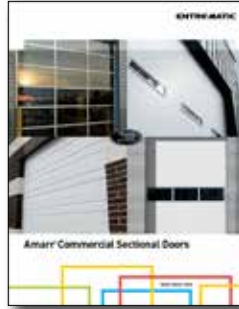
Steel & Aluminum Sectional