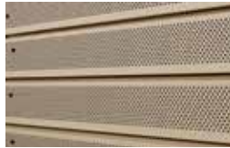
Perforated Slats (22 ga Gray and Tan only)