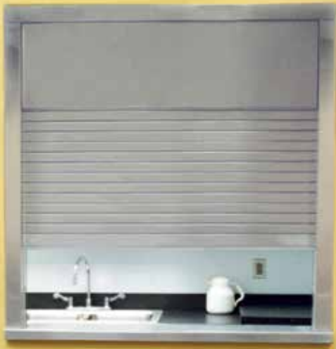
Amarr 4411 with integral sill and frame